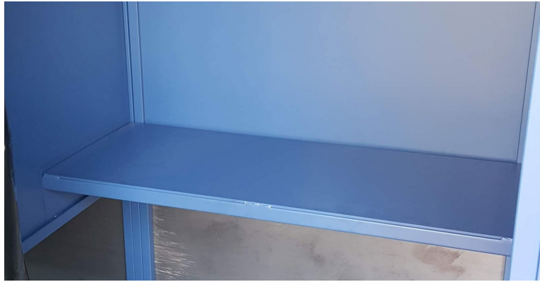
Pictured: Side to Side Mounted 3/8" Steel Table