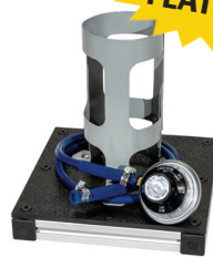
New Propane Canister Holder included with TU-502